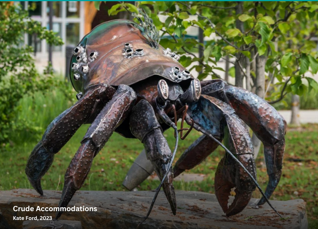
Crude Accommodations Kate Ford, 2023